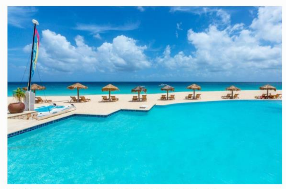
Francipani Beach Resort o thierry dehove photography / Francipani Beach resort

The intimate, boutique-size Frangipani Beach Resort (photo above), peacefully welcoming on Meads Bay, is family owned and operated, which means guests garner even more personalized attention from staff and galvanize an understanding of authentic Anguillian culture. Its flavorful Straw Hat Restaurant remains popular. A new rooftop lounge and Balinese-theme spa add sparkle. Focusing on sustainability and renewable energy, solar power will soon be incorporated into the property. At beachfront cabanas, massage therapists ease stress away while ocean sounds serve as soothing background music.