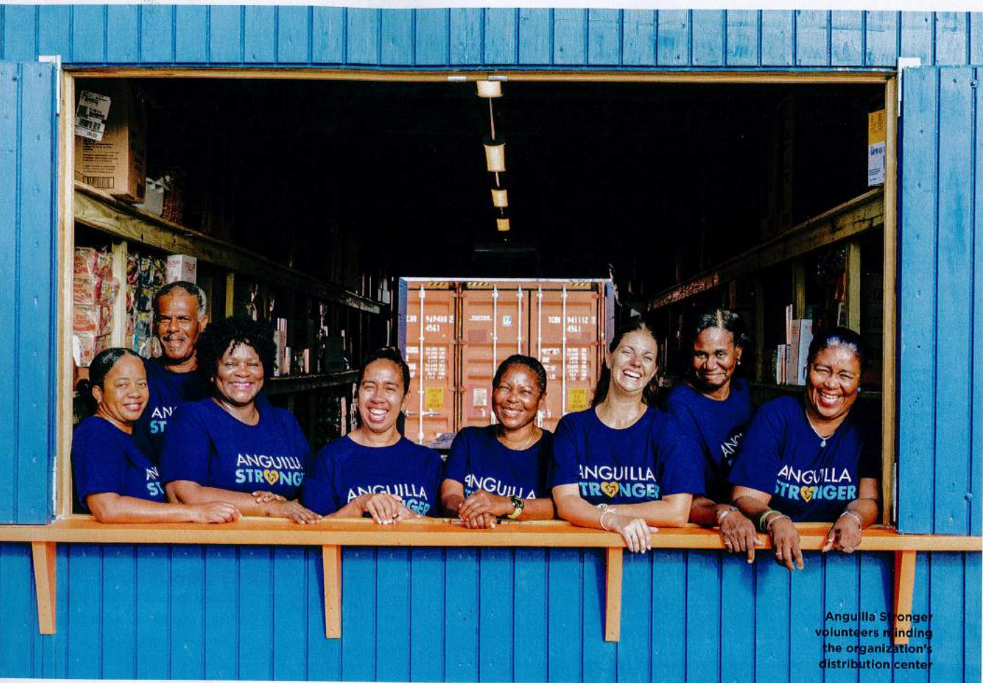
Anguilla Stronger volunteers minding the organization's distribution center