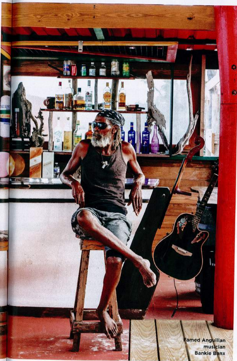
Famed Anguillian musician Bankie Banx

trees and power poles, making 90 percent of its roads impassable, leaving damages exceeding $190 million, and killing one resident.